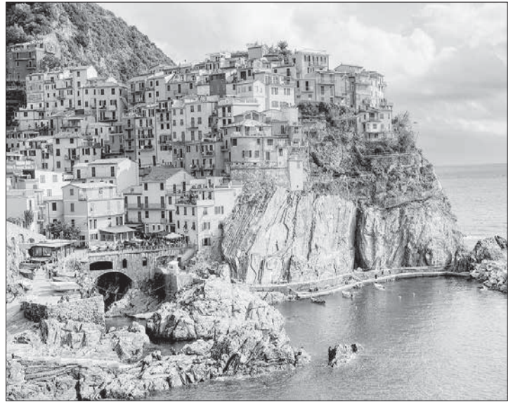
Cinque Terre, Italy